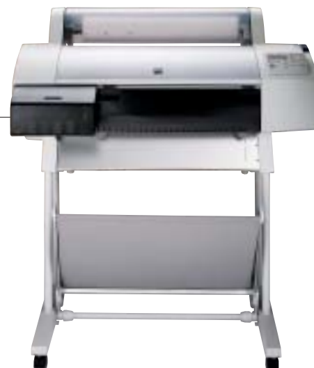
EPSON Stylus Pro 7000 model shown with optional printer stand.